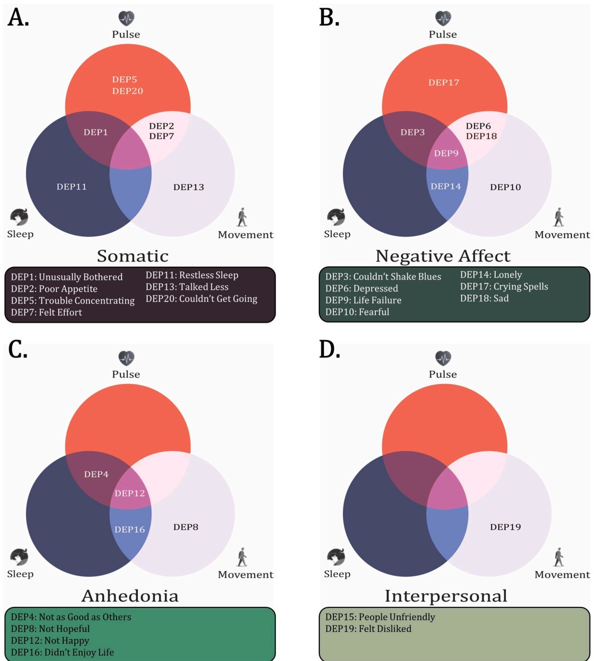
Fig. 2. CES-D item-stream significant association overlap by factor. Note. Venn diagrams (organized by CES-D factor) show patterns of significant associations ( P < 0.05 ) between depression items and passive sensing streams. (A) Somatic factor; (B) Negative affect factor; (C) Anhedonia factor; (D) Interpersonal factor.

being “sad” (DEP18), and being “depressed” (DEP6) could represent manifestations of ruminative behavior which has been shown to spur increases in heart rate (Gerteis & Schwerdtfeger, 2016). Interestingly, the highest increases in heart rate as a consequence of rumination have been found to occur during ambiguous social interactions (Gerteis & Schwerdtfeger, 2016). Day-to-day life on a college campus likely involves several types of interactions with professors, staff, and other students across various settings and contexts that vary on continua of familiarity and formality. Thus, it is possible that some social interactions as a college student may serve to exacerbate heart rate response to ruminative processes that partially define a depressive state. The overall versatility of heart rate as a signal for depression symptomatology may also be due to its physiological ties to both movement